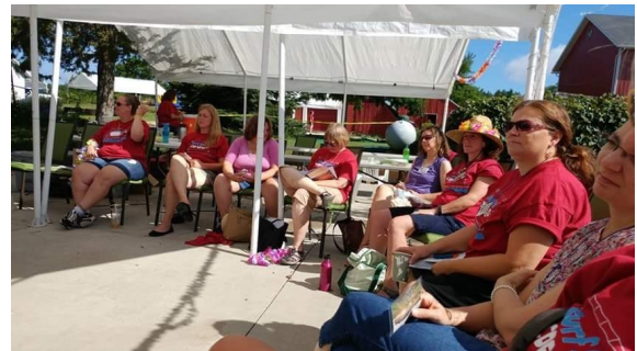
The Mother's Group—giving these mother's of Special needs children a much needed break.